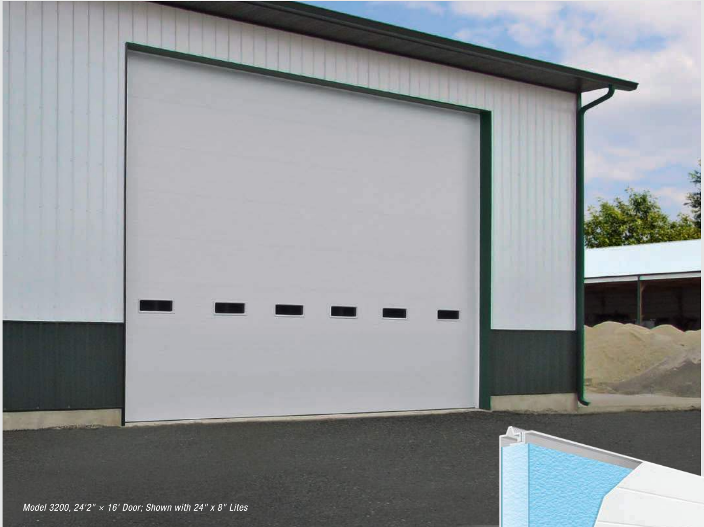
Model 3200, 24'2" x 16' Door; Shown with 24" x 8" Lites